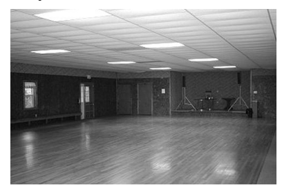
Wooden Dance Floors

2 halls (Advanced and Plus) during the dayEvening dances:2 Plus tips followed by 1 Advanced tipwith Rounds in between all