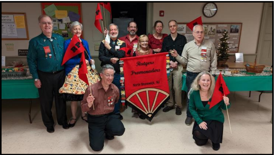
Rutgers Promenaders at our raid of Hunterdon Flutterwheels