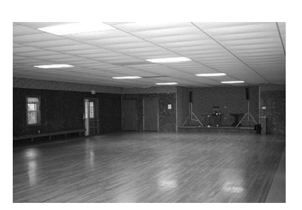
Wooden Dance Floors

2 halls (Advanced and Plus) during the day